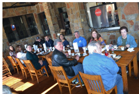
At Hard Eight BBQ.