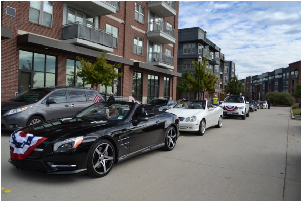
Ready to go.

Mercedes-Benz Financial Services invited us to drive our cars in Roanoke's Veterans Day Parade. Twenty-six members in 15 cars attended. They brought their favorite Mercedes, old or new, coupe, sedan, SUV or convertible. In addition to our 15 cars, 3 MBFS electric Mercedes participated.