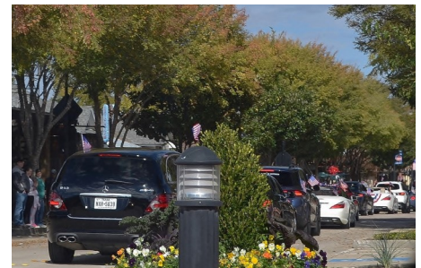
The parade is underway.