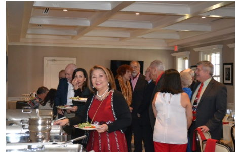
Time to eat.