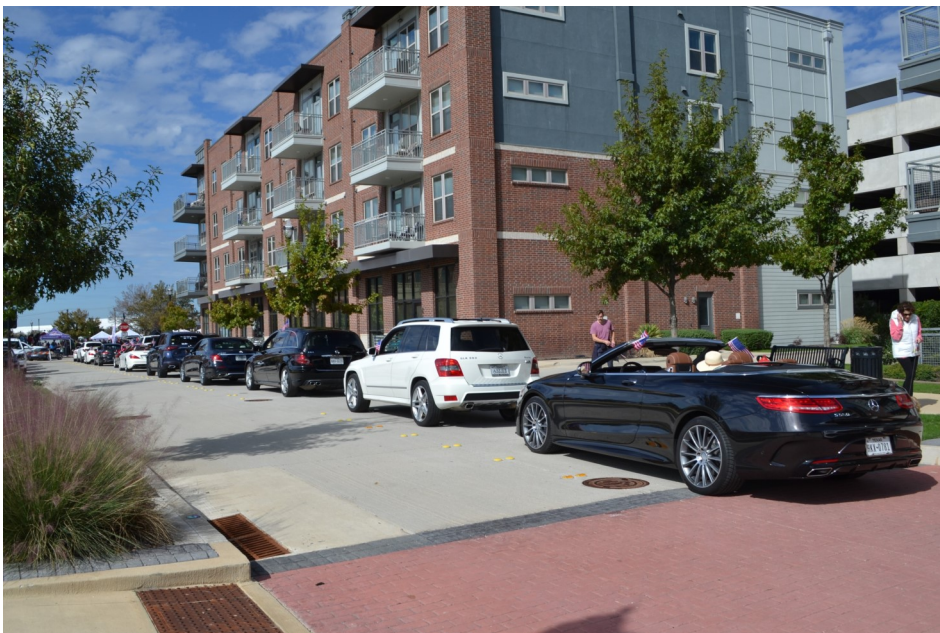
Forming up in downtown Roanoke.