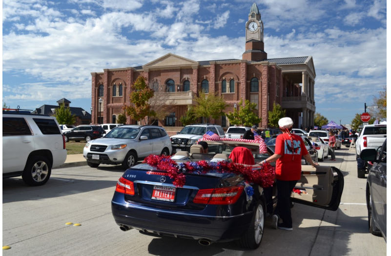
All decked out by the Roanoke city hall.