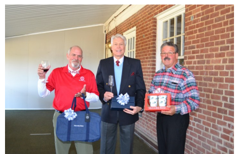
The happy Benz Balls winners.