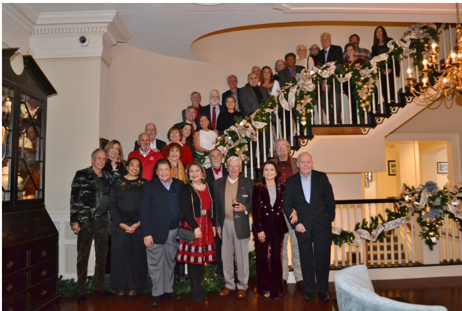
The group poses for a festive Holiday photo.