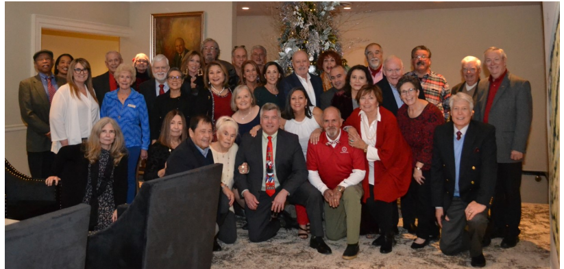
Everyone is here! Well, almost.