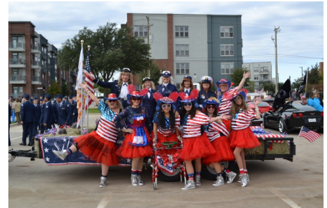
These ladies were hilarious!