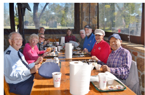
We had the patio all to ourselves.