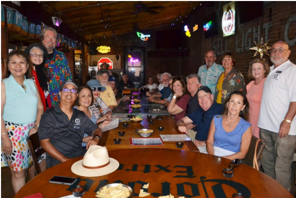
Lunch at Frescos Cocina Mexicana.

Our event started with a backroads drive to Burleson. We had a great Mexican lunch at the highly-rated Frescos, located in the heart of Burleson's downtown.