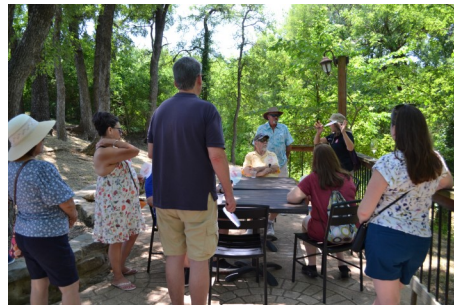
Guided winery tour.