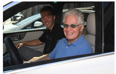
Having fun while trying out Mercedes EV's.