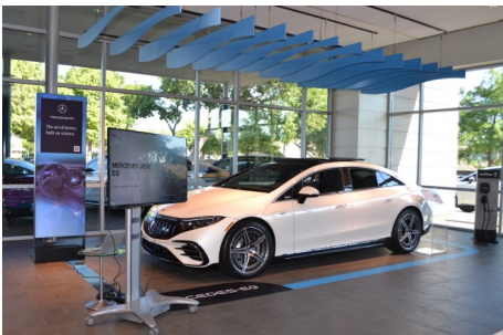
The stage is set. This is the awesome AMG EQS!