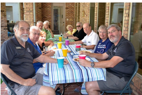
It was surprisingly pleasant outside.