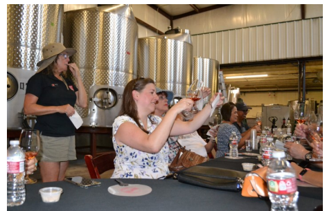
Wine tasting in full swing.