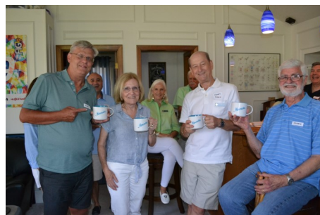
First place winners.