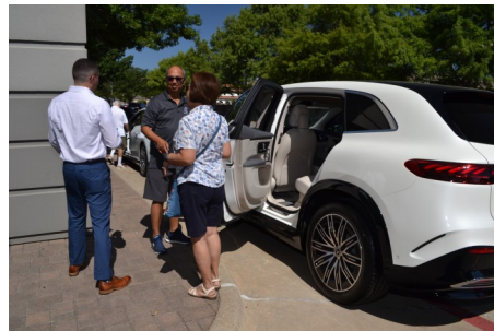
Time for test drives.