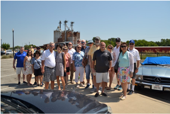
Arrival at Burleson, TX.

Thirty folks in 17 cars joined us for a nice country drive, a Mexican lunch at Frescos Cocina Mexicana, and a visit to the Lost Oak Winery in Burleson for wine-tasting and a winery tour.