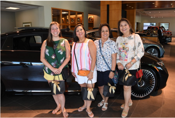
Fort Worth Section ladies with their goodie bags.