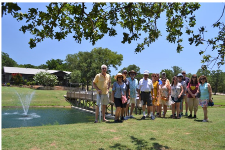
Summer sun? No problem. Kinda.