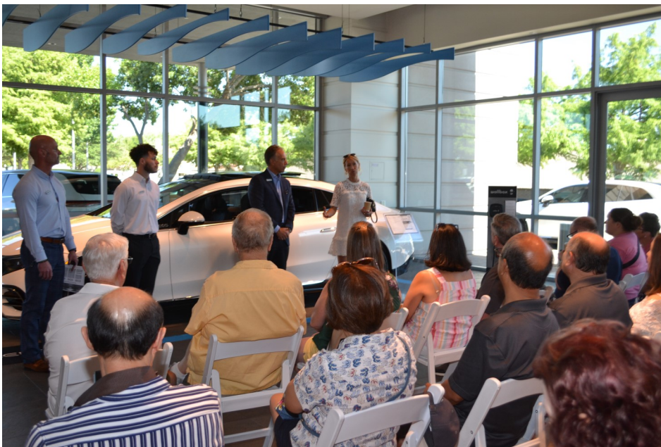
The presentation is in full swing.