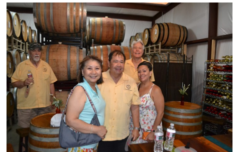
The barrel room.