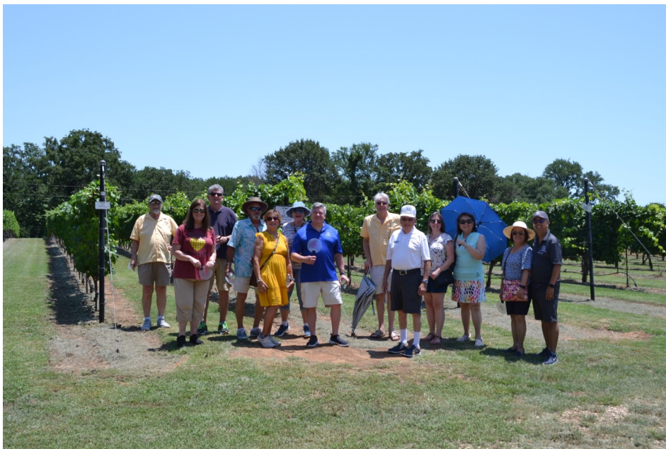
At the Lost Oak Vineyards.

After the tour and tasting, some of us remained at the winery to enjoy Lost Oak's excellent viognier and bar eats.