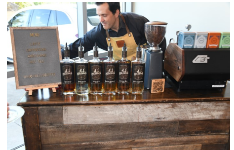
Full coffee bar for everyone to enjoy.