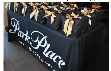
Goodie bags for all.