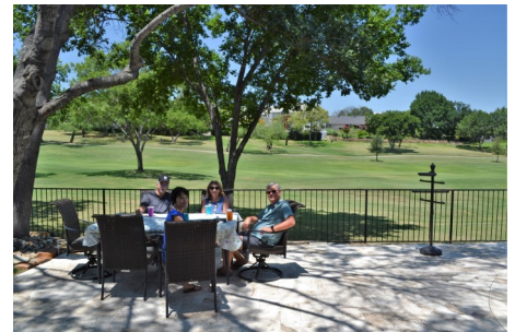
Enjoying the shade and the golf course.