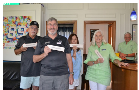
The runners up.