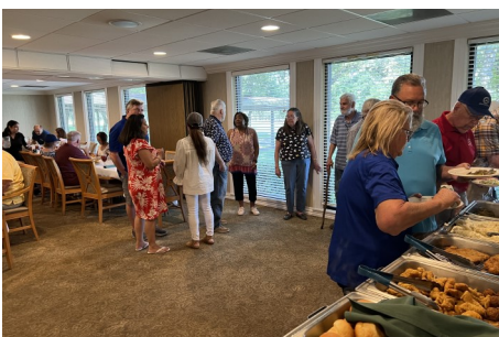
Enjoying lunch at the Graham Country Club.