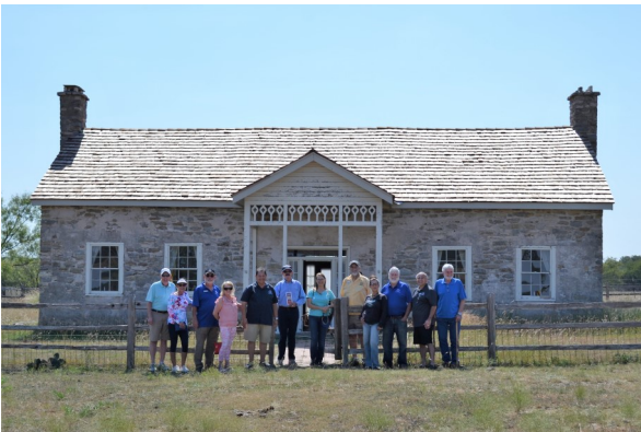
The group at the Ringness House.