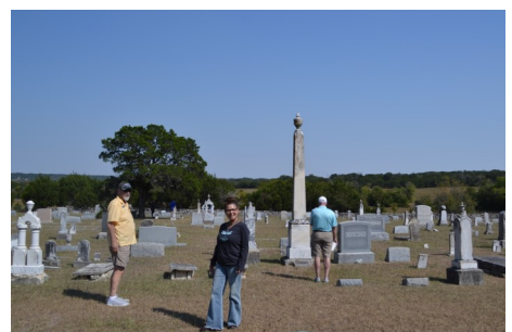
Exploring Our Savior's Norse Cemetery.