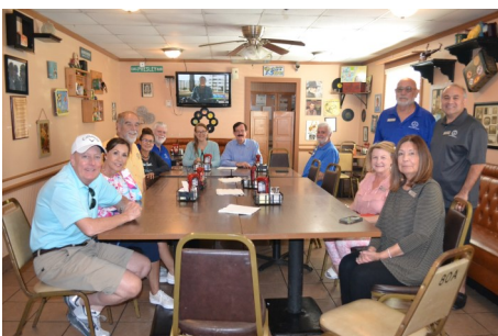
Lunch at Johnny's Place in Clifton.