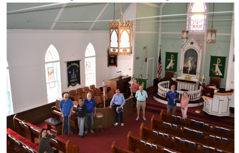
Interior of Our Savior's Lutheran Church.