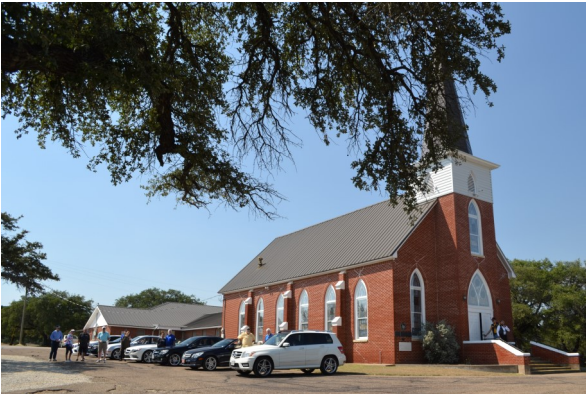
The lineup at the Old Norse Church.

Fourteen folks in 7 cars joined us for a trip to Norse, which was once a bustling settlement of Norwegian immigrants in Bosque County. Only about 100 widely-dispersed people remain in this community today.