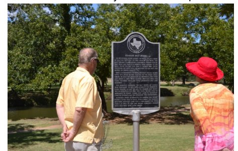
Site of Graham's old Salt Works.