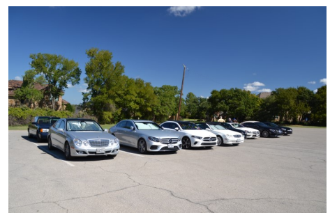
The lineup at the Graham Country Club.