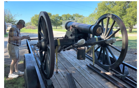
Period artillery at Fort Belknap.