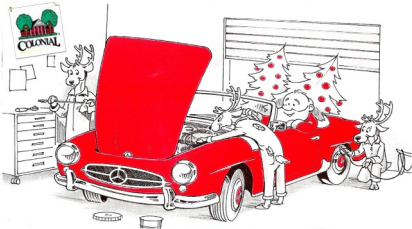
Fort Worth Section's Holiday Luncheon at the Colonial Country Club Saturday, December 10, 2022, 11am-2:30pm

Our 2022 Holiday Celebration will be a buffet lunch at the famous Colonial Country Club, site of the Charles Schwab Challenge professional golf tournament. Let us jump start the holidays with good food, games, prizes, and camaraderie with our fellow MBCA members. The agenda, menu and other details follow below.