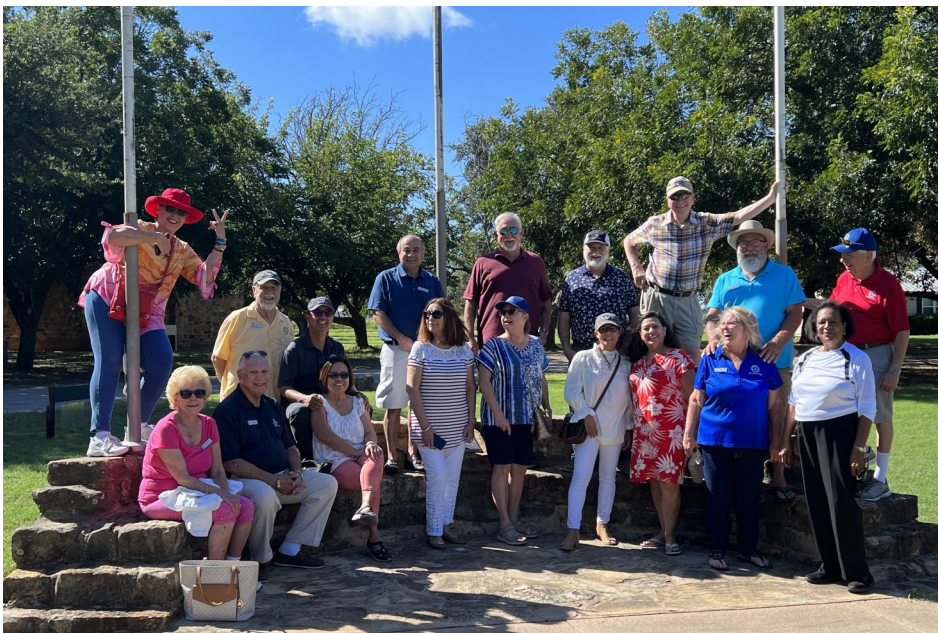
The gang at Fort Belknap.