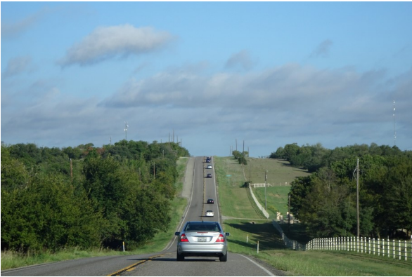
The caravan en route to Fort Belknap.

Thirty-one folks in 16 cars joined us for a country drive, a visit to historic Fort Belknap in Newcastle, a delicious buffet lunch at the Graham Country Club, and a visit to Graham's Old Post Office Museum at the center of the town's courthouse square, the largest such square in the country.