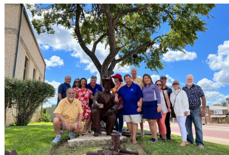
Photo op by the Old Post Office Museum.