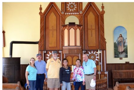
Inside the Rock Church.