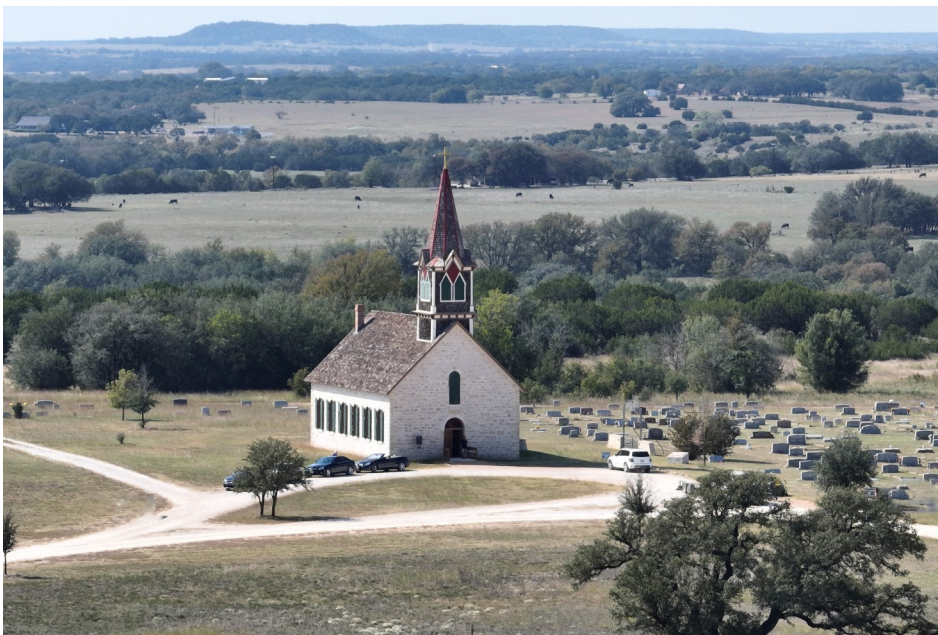
St. Olaf's Kirke, the Old Rock Church, its adjoining cemetery and surrounding landscape.